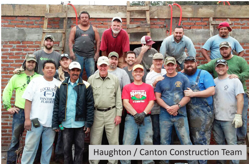
Haughton / Canton Construction Team