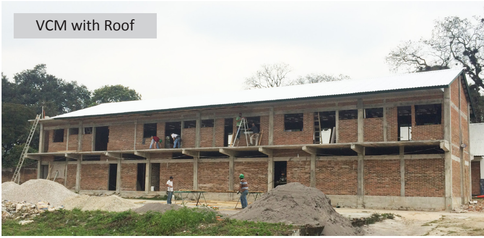
VCM with Roof

prayers and giving of your means to further the Work of the Lord here at MITC. You are as much a part of God's mission here in Mexico as each of us here in the field. Many of you have served with us in this way for many years. We praise the Lord for you and for His blessing and continuing provision through you. To God be the Glory and Muchas Gracias (many thanks) to each one of you.